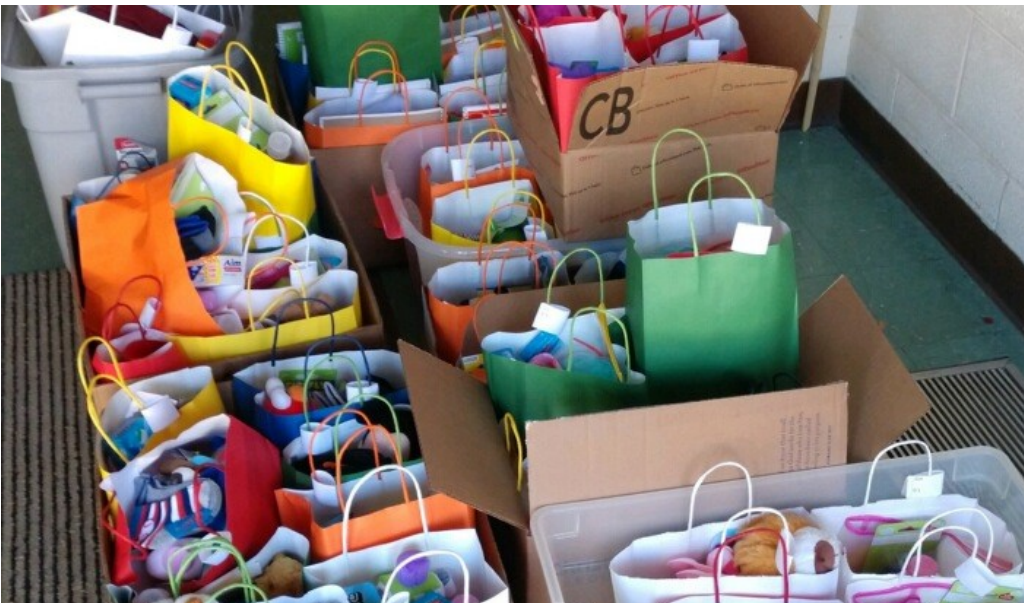
Bags filled with items were delivered in December to Lutheran Family Services by the Wider Ministries Committee. They have done this for many years for kids in the LFS programs at Christmas time.

Vision Statement: To Grow in Faith, Love, and Spirit