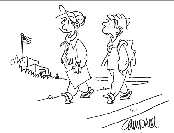
"I made a New Year's resolution to eat broccoli. If I can't stand it, I'll give it up for Lent."

If you are interested in helping to run the soundboard or streaming equipment, please let us know. We can always use more help!